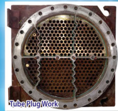
Tube Plug Work