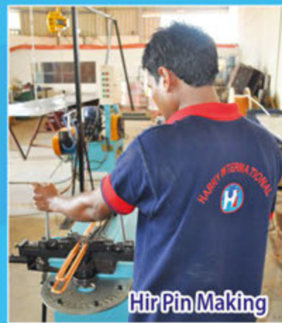
Hair Pin Making